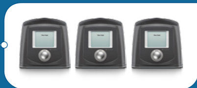
F&P ICON™/ICON™+ CPAP Family

InfoUSB is used as an accessory to the following: F&P ICON/ICON+, Sleepstyle™ 200 Auto and Sleepstyle 200 (HC242/HC244) series of CPAP devices.